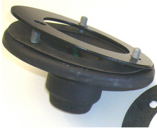
Illustration strut support

attached on both sides in 3 places using blind rivet nuts (12 mm bores needed in frame structures) and torx screws (M8). The strut supports will be supported by an additional reinforcement ring from above.